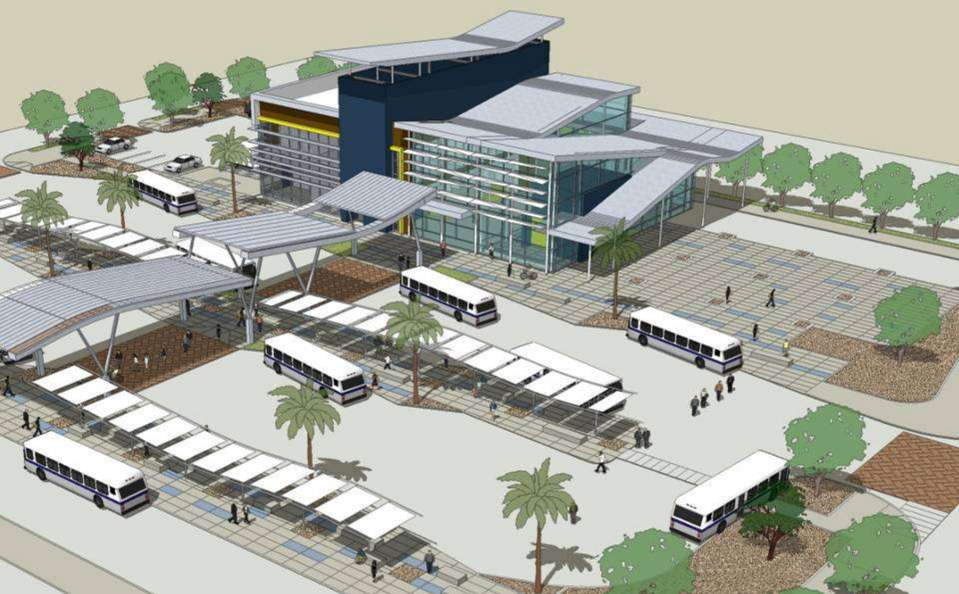
Bonneville Transit Center