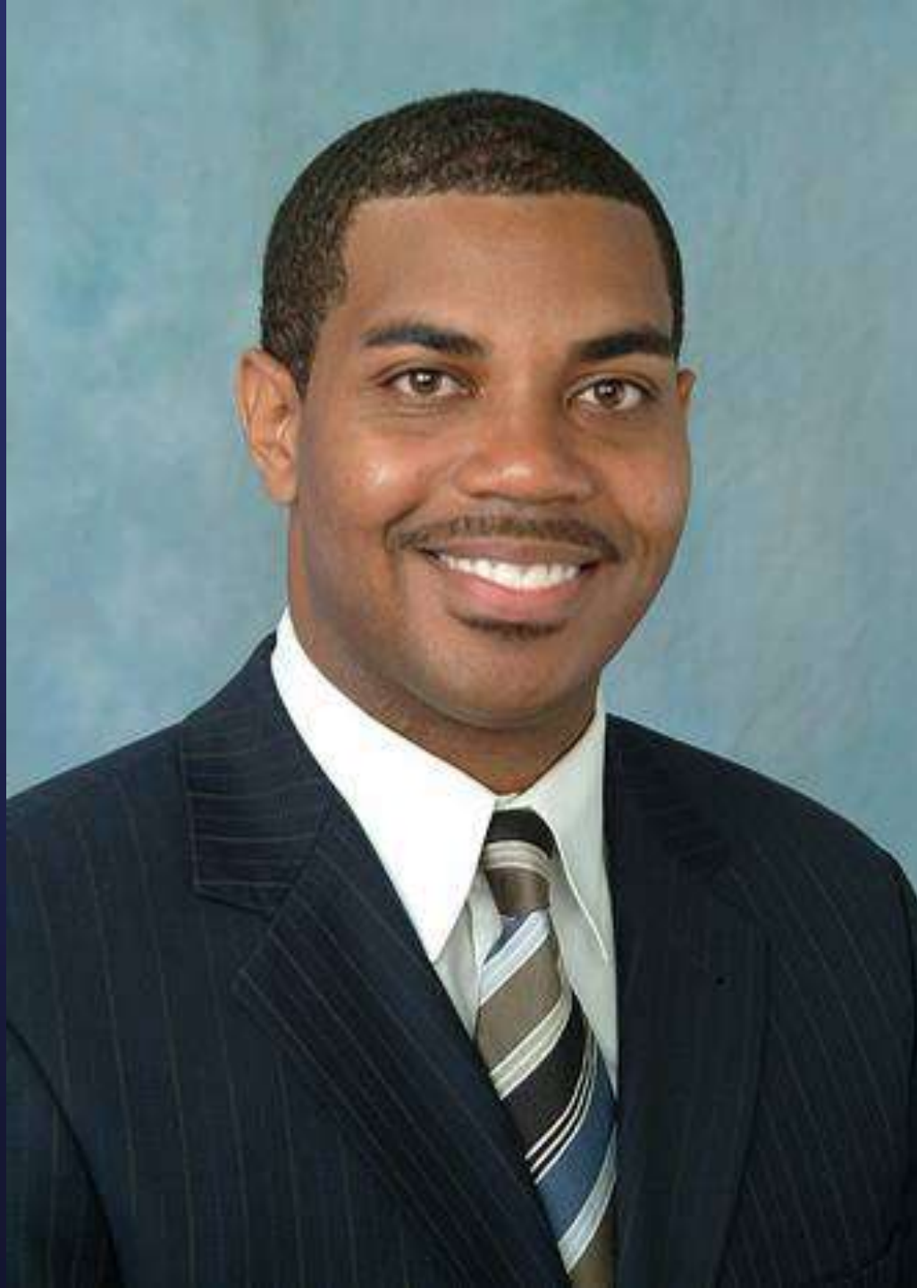
Steven Horsford, Senator