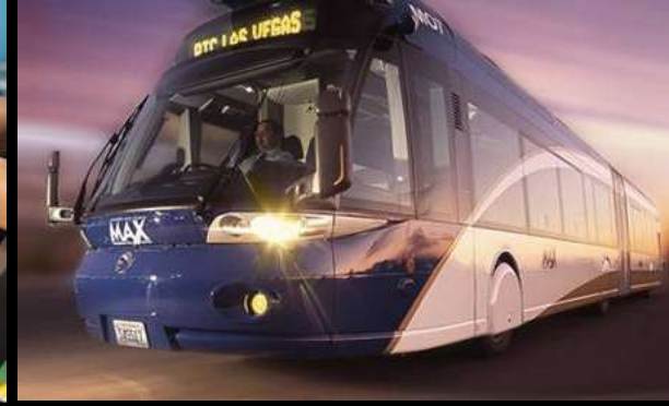
Federal Transit Administration