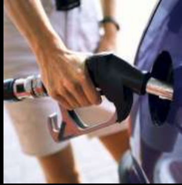
Motor Vehicle Fuel Tax