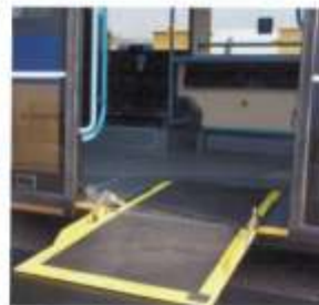
Level boarding facility