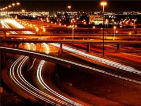
Federal Highway Administration